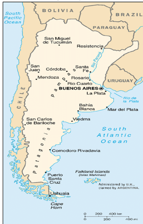
Map 1: Argentina

This paper analyses the origins of the 2004 energy crisis, examines the effects on the national gas industry and evaluates the government's solutions to prevent further shortage and restore the attractiveness of the gas industry for foreign and domestic investors. The impacts of the Argentine crisis on surrounding countries and on the regional energy integration are considered in a final appendix.