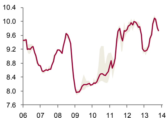
Figure 1: Saudi oil production, million b/d

This fact implies a different oil market from that of the past five years. Back in 2008/2009, when oil prices had fallen sharply, it was Saudi Arabia that sent a clear signal stating that $70 was a 'fair' price for both producers and consumers. Since then, Saudi Arabia has consistently signaled their preferred price range, which has risen from $70-$80 to be $90-$100 per barrel. The market took this as a signal that Saudi Arabia is willing to defend the oil prices below $90 by reducing output. Since last year, the Kingdom also started signaling a willingness to act to support their preferred upper limit to prices, in order to prevent the global economy and oil demand from weakening, by raising output to record levels above 10 million b/d at various times through 2012 and 2013. Thus, the quarterly average floor and ceiling oil prices were largely set by significant changes in Saudi production volumes (see Figure 1). Despite the various supply shocks and the wide global macroeconomic uncertainty, the Brent price traded within a relatively narrow range. But, in the emerging market paradigm, Saudi Arabia may still be willing to cap oil prices to the upside, but its commitment to limit the downside may have diminished, especially if limiting that downside involves losing market share to other low cost producers within OPEC.